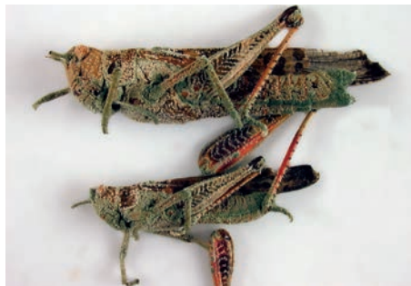
Biological control with metarhizium infection ^