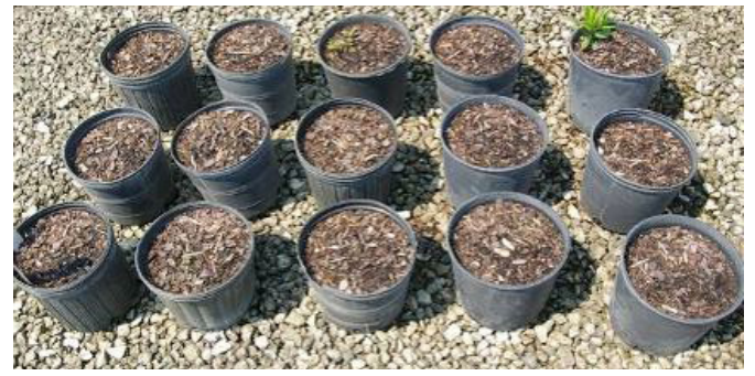
Freehand Herbicide applied at 10g/m<sup>2</sup>