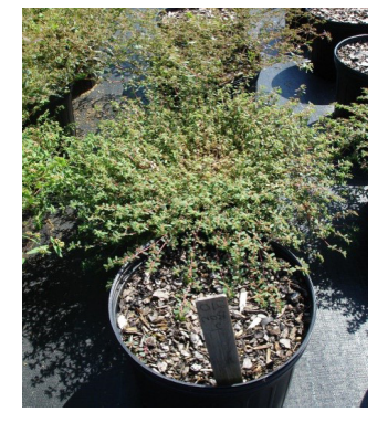
20g/kg Oxadiazon, 200kg/ha