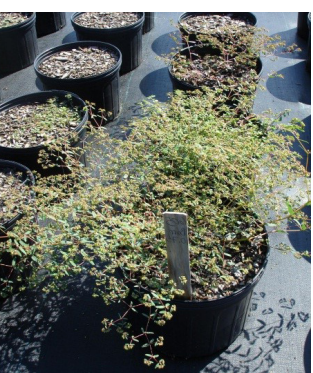
480g/L Prodiamine, 2L/ha