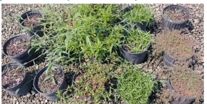
20g/kg Oxadiazon applied at 10g/m<sup>2</sup>