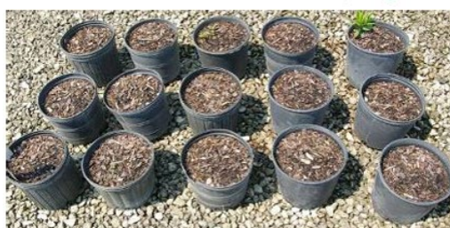
Freehand Herbicide applied at 10g/m²