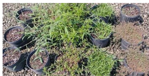
20g/kg Oxadiazon applied at 10g/m²