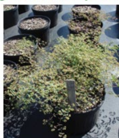
480g/L Proflam, 2L/ha